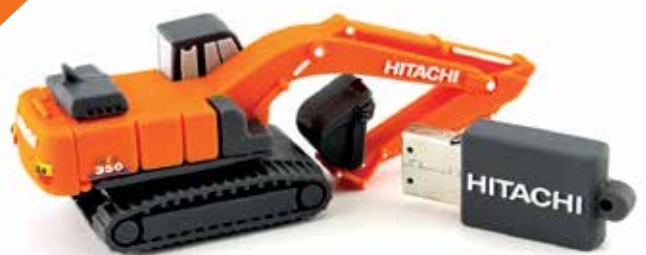
3D USB Excavator ZX350-6 8Gb