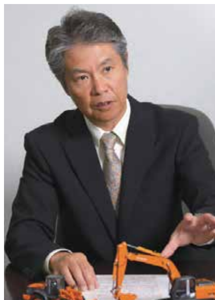
Life Cycle Support Operations Group Customer Support Division ConSite Development & Promotion Department General Manager

ConSite Monthly Report includes not only operation data, but also improvement suggestions automatically generated as based on trend analysis and engine operation time forecasts for the following year, assisting with maintenance cost