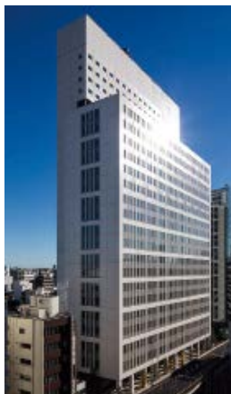
Ueno East Tower